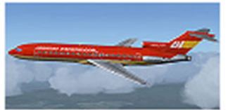
Boeing 727-200 Braniff