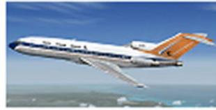
Boeing 727-100 South African Airlines