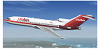
Boeing 727-100 US Airlines