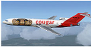
Boeing 727-200 Freighter Cougar