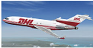
Boeing 727-100 QW Freighter DHL