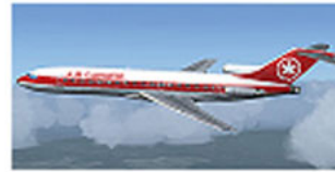
Boeing 727-200 Air Canada