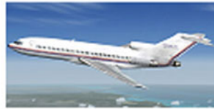
Boeing 727-100 UDF Boeing UDF