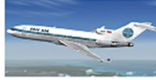
Boeing 727-100 QW Pan Am