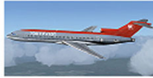
Boeing 727-200 Northwest