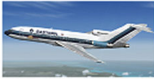
Boeing 727-100 Eastern Airways