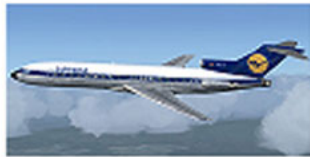
Boeing 727-200 Lufthansa