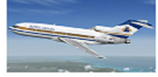
Boeing 727-100 British Airways