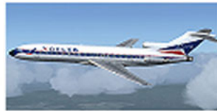
Boeing 727-200 Delta Airlines