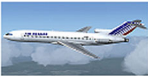
Boeing 727-200 Air France